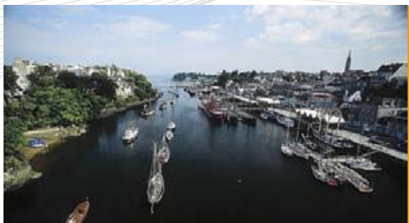
Baie de Douarnenez